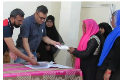
Handing over the first cheque to our SHG members